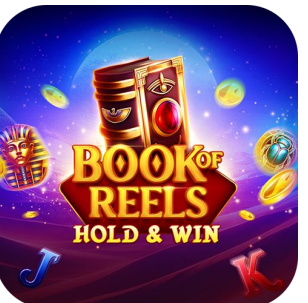
Book of Reels Hold & Win