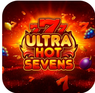
Ultra Hot Sevens