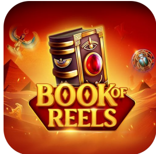
Book of Reels