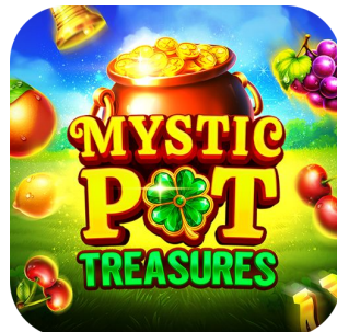
Mystic Pot Treasures