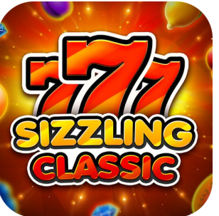
Sizzling 777 Classic