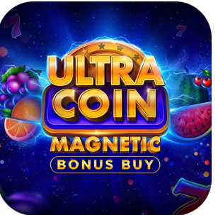
Ultra Coin Magnetic Bonus Buy