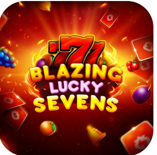
Blazing Lucky Sevens