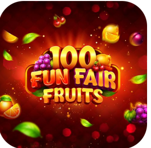
Fun Fair Fruits 100