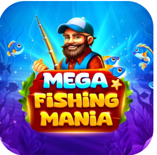
Mega Fishing Mania