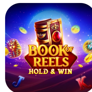
Book of Reels Hold & Win