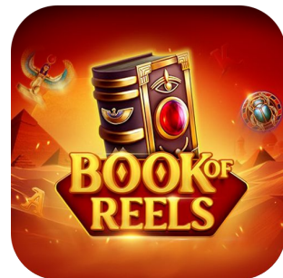
Book of Reels