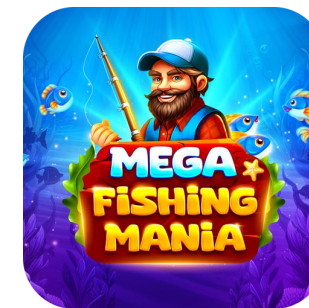
Mega Fishing Mania