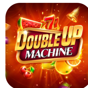
Double Up Machine