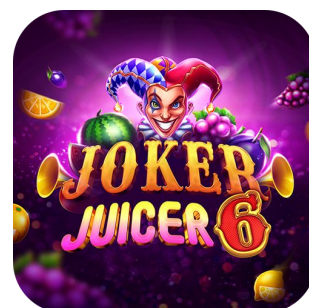
Joker Juicer 6