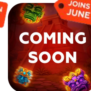
Jaguar's Mystic Ways