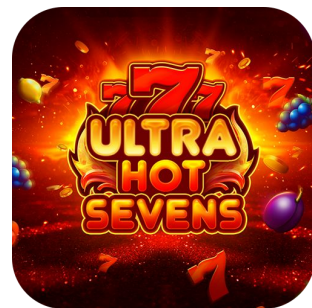
Ultra Hot Sevens

The list of games is available via the link