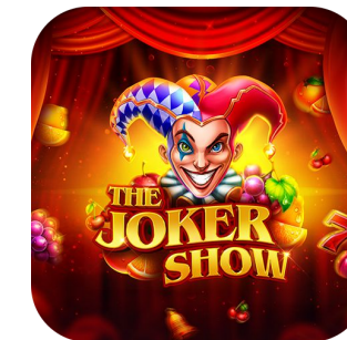
The Joker Show