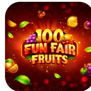
Fun Fair Fruits 100