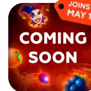
Ultra Hot Joker