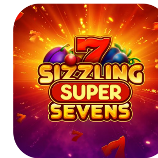
Sizzling Super Sevens