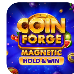
Coin Forge Magnetic