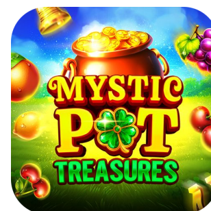
Mystic Pot Treasures