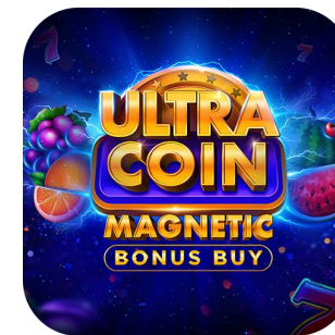
Ultra Coin Magnetic Bonus Buy