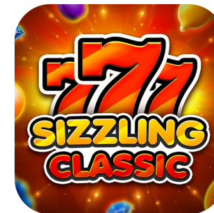
Sizzling 777 Classic