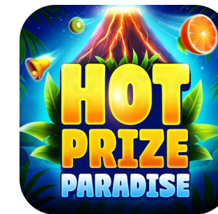
Hot Prize Paradise