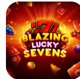
Blazing Lucky Sevens