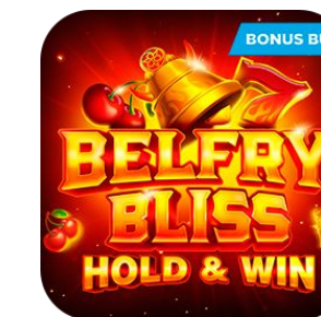
BELFRY BLISS HOLD AND WIN