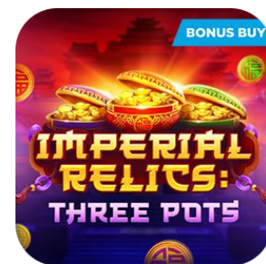
IMPERIAL RELICS: THREE POTS