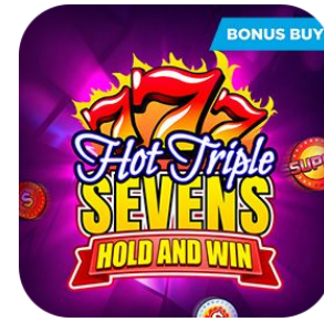
HOT TRIPLE SEVENS HOLD & WIN