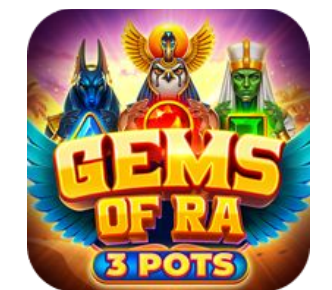
GEMS OF RA 3 POTS