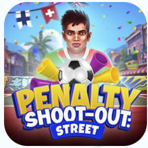
PENALTY SHOOT OUT STREET