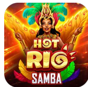
HOT RIO SAMBA