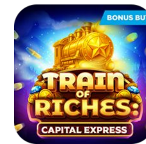
TRAIN OF RICHES: CAPITAL EXPRESS