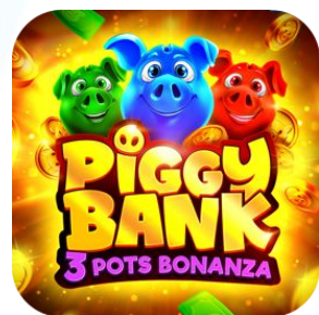
PIGGY BANK 3 POTS BONANZA