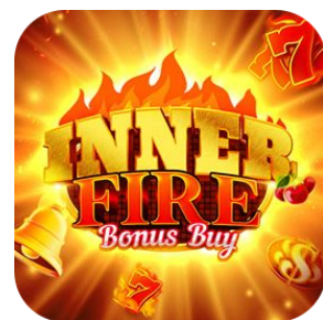
INNER FIRE BONUS BUY