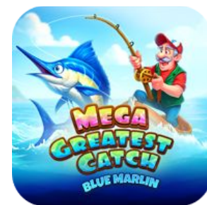
MEGA GREATEST CATCH BLUE MARLIN