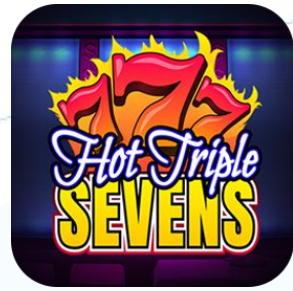
HOT TRIPLE SEVENS

The list of games is available via the link