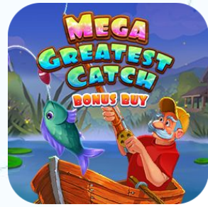
MEGA GREATEST CATCH BONUS BUY