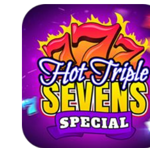
HOT TRIPLE SEVENS SPECIAL