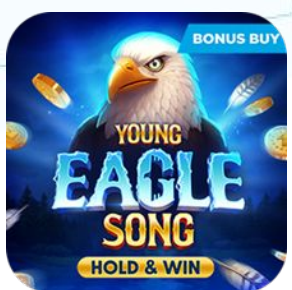
YOUNG EAGLE SONG