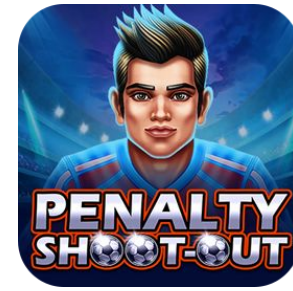
PENALTY SHOOT OUT