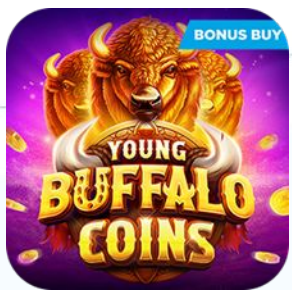
YOUNG BUFFALO COINS