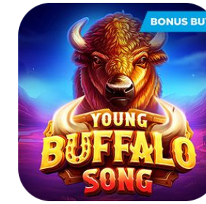
YOUNG BUFFALO SONG