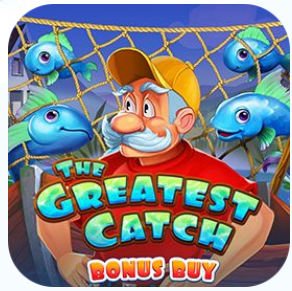
THE GREATEST CATCH BONUS BUY