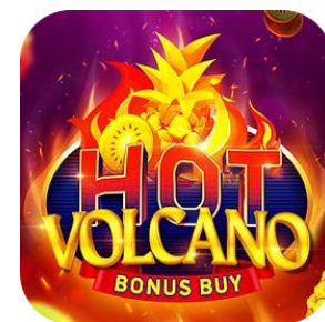
HOT VOLCANO BONUS BUY