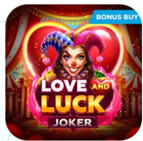
LOVE AND LUCK JOKER